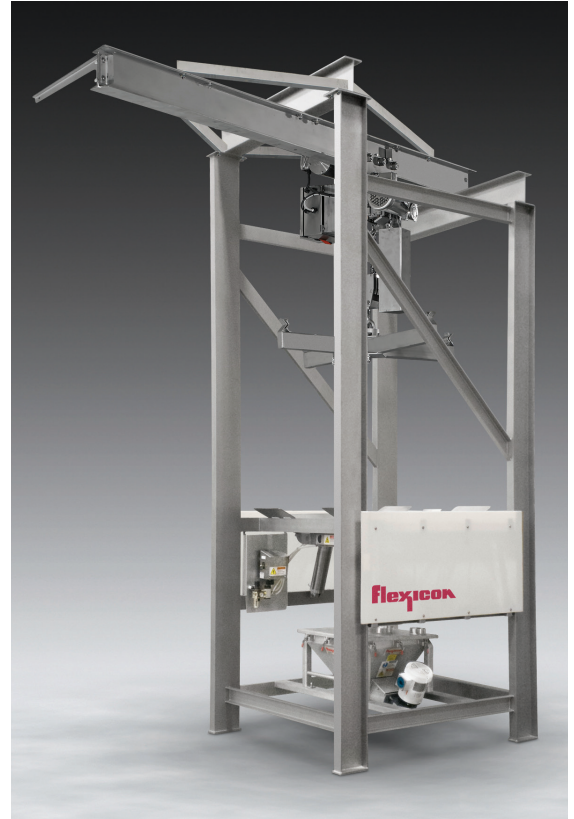
Open-channel stainless steel construction of Flexicon Bulk Bag Discharger eliminates internal voids where contamination can breed, and allows rapid sanitizing and inspection.

BFC Series dischargers are available in over 30 configurations constructed and finished to pharmaceutical, food, dairy or industrial standards. Also available are BFF Series dischargers with a removable bag lifting frame for loading and unloading of bulk bags using a forklift, and BFH half frame models that rely on a forklift to suspend the bag during discharge.