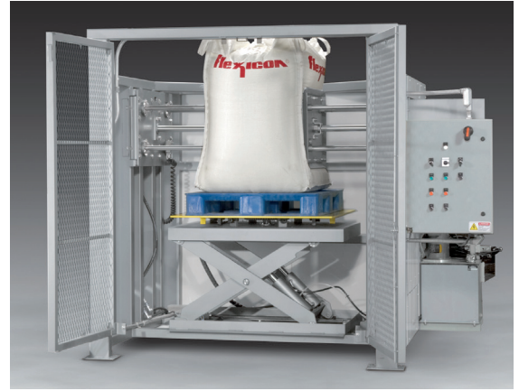
Stainless Steel Bulk Bag Conditioner with programmable scissor lift and automated turntable raises, lowers and rotates the bag in any degree for complete conditioning on all sides at all heights.

The system controller and hydraulic pump can be mounted remotely or on the exterior of the safety cage, and requires only an electrical power connection for operation.