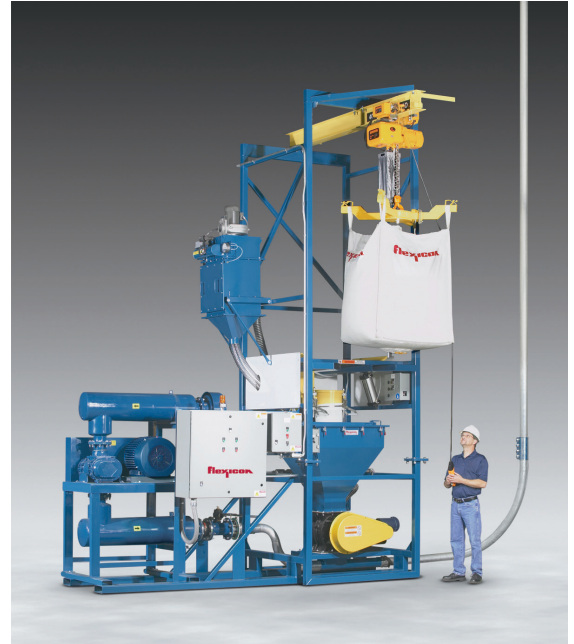
Flexicon Bulk Bag Discharger with integral Pneumatic Conveying System transfers material from bulk bags into bulk storage vessels at locations unable to receive the material by rail or bulk truck.

The unloaders' surge hopper is equipped with a high capacity rotary airlock valve to feed material into a pneumatic conveying line leading from a positive displacement blower at high rates.