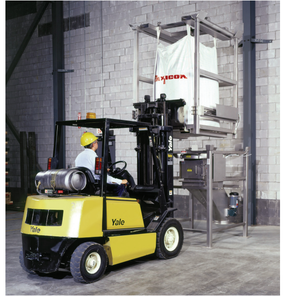
Split Frame Unloader allows discharging of bulk bags and rigid totes from mezzanines and other low headroom areas. The flanged discharge chute of the frame shown is offset to direct material into an off-center receiving vessel below a mezzanine.