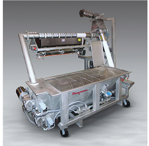
Flexicon Spreader-Feeder evenly distributes spices, seeds and other bulk coatings onto food products passing beneath the system's discharge hopper, while collecting and recirculating excess material.

Suitable for food and other sanitary applications, the system features all-stainless construction including motors and vibrators, and quick-disconnect fittings for thorough, rapid wash down.