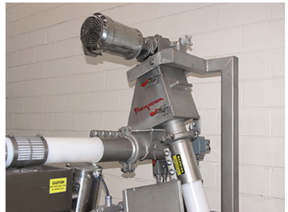
Flexicon Spreader-Feeder evenly distributes spices, seeds and other bulk coatings onto food products passing beneath the system's discharge hopper, while collecting and recirculating excess material.