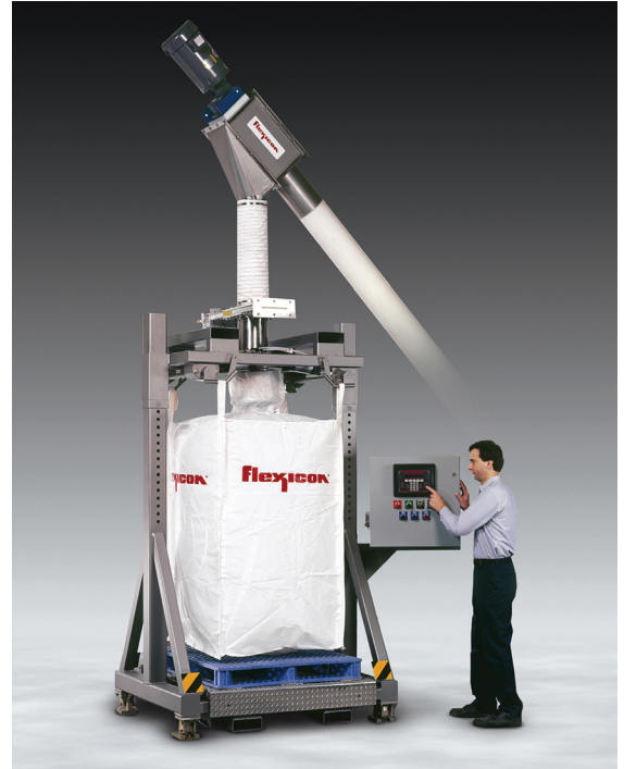
Available as basic, low-cost units or with numerous performance enhancements

All system components are available constructed to industrial, food, dairy and pharmaceutical standards.