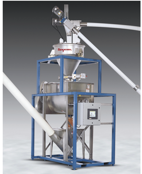
Automated system can be integrated with new/existing processes, conveyor systems

The weigh batching and blending system is offered in carbon steel with durable industrial coatings, or stainless steel finished to industrial, food, dairy or pharmaceutical standards.