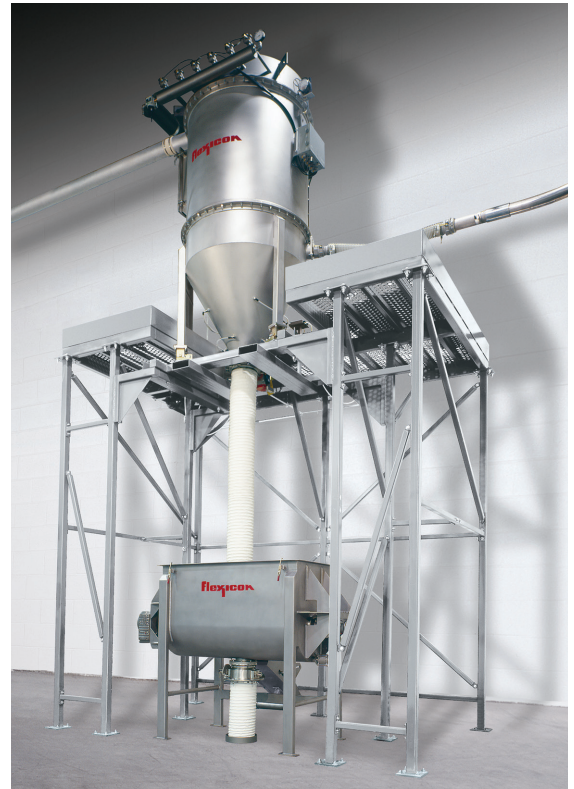
Accumulated ingredients automatically discharged via slide gate valve

In addition to the filter receiver and weigh batching controls, pneumatic conveying systems are available complete with vacuum pump/pressure blower and rotary airlock valves for sourcing multiple batch ingredients from storage vessels and process equipment located throughout the plant.