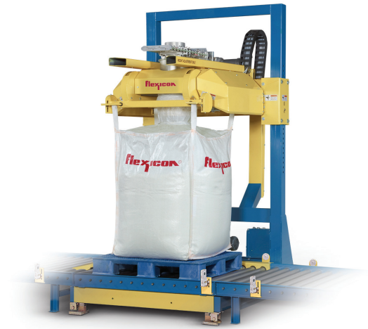
Powered fill head height adjustment accommodates bulk bags of all popular sizes

All system components are available constructed to industrial, food, dairy and pharmaceutical standards.